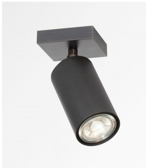
DEIMOS S1 # in brushed bronze