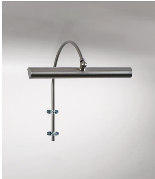
TRIANON 25 in brushed nickel