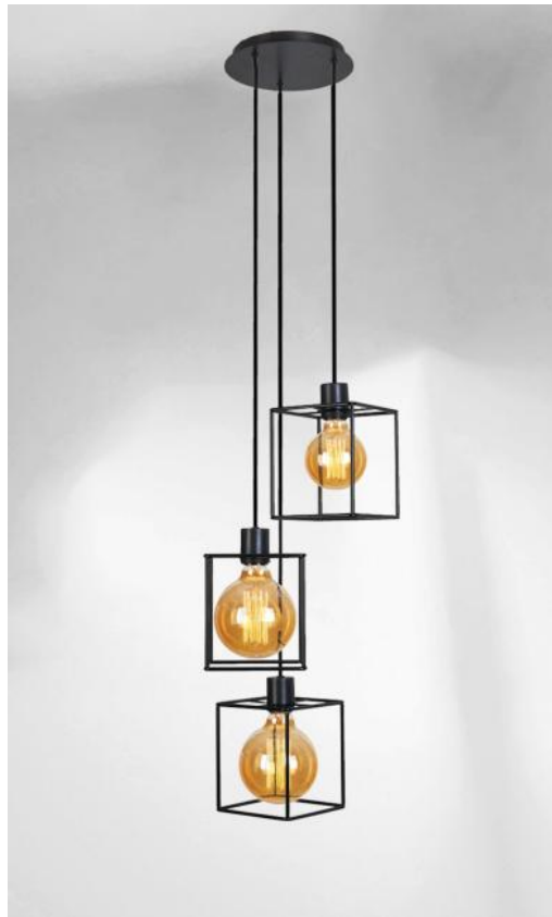
KERMA 3 o20 in brushed bronze with structures in black epoxy