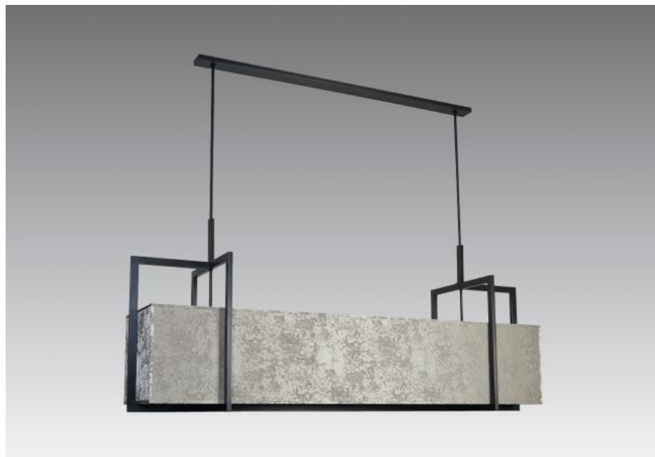
MELETIS in brushed bronze with shade in gabala platinumium

Great suspension with a rectangular shade. Adjustable in height when mounting.