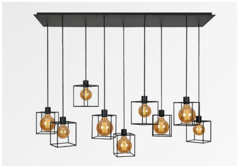
KERMA 9 # in brushed bronze with structures in black epoxy