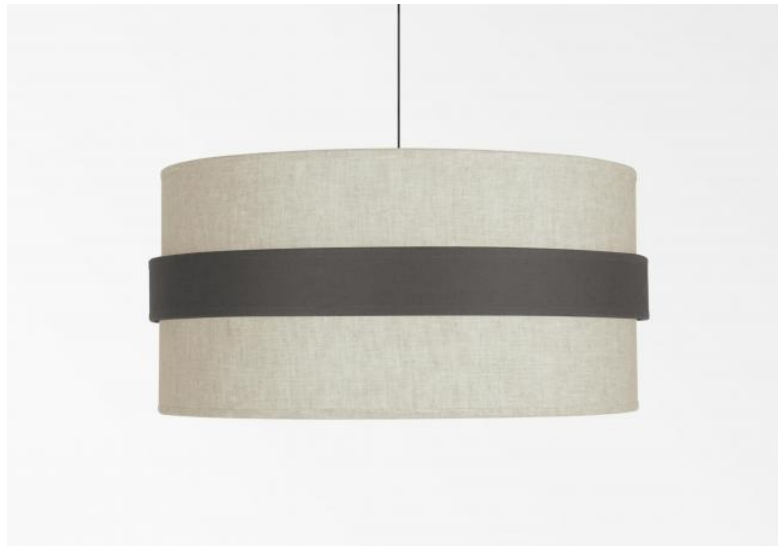
Lampshade TOUYA 45 in Lin Moscou (fabric from category 2) with ring in Seta anthracite