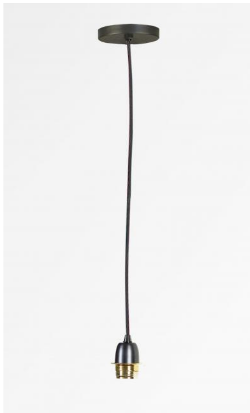
SUSPENSION o in brushed bronze