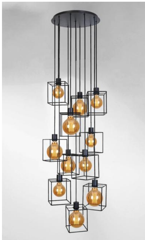
KERMA 11 o38 in brushed bronze with structures in black epoxy