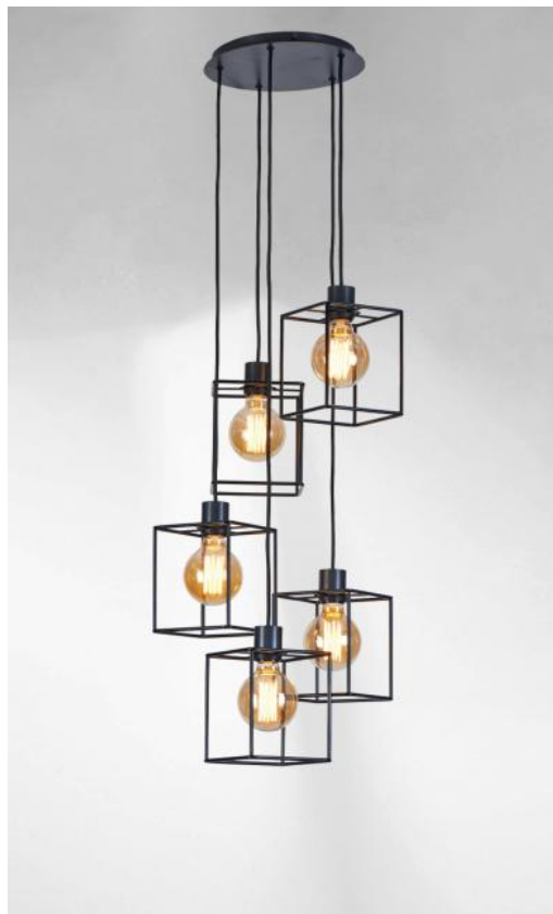
KERMA 5 o26 in brushed bronze with structures in black epoxy