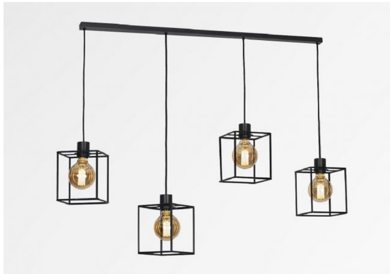
KERMA L 4 in brushed bronze with structures in black epoxy