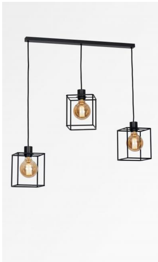
KERMA L 3 in brushed bronze with structures in black epoxy