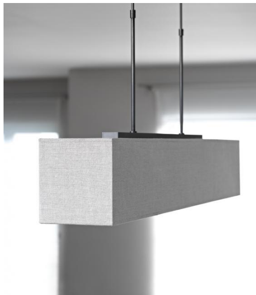
HENOUTMIRE 3 in brushed bronze with lampshade MEDIUM in Lin Pompéi (fabric from category 2)