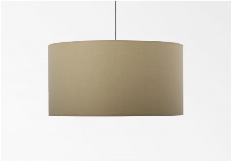
Lampshade KENTIKA 35 in Coton Chamois (fabric from category 1)