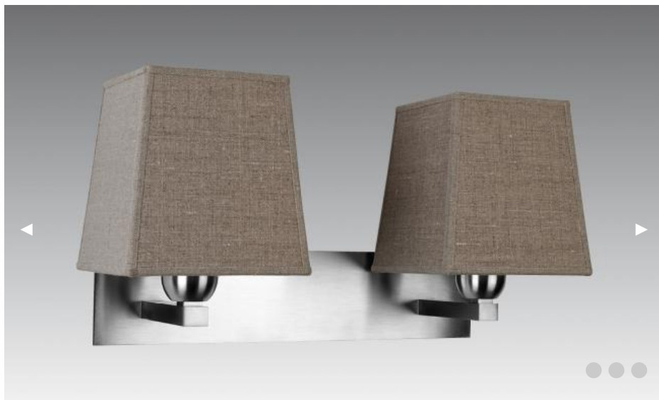
MONTOU # in brushed chrome with shade in lin pompéi