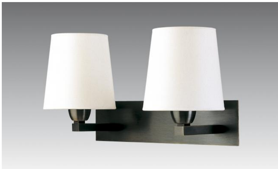
MONTOU o in brushed bronze with shades in chinette ivoire